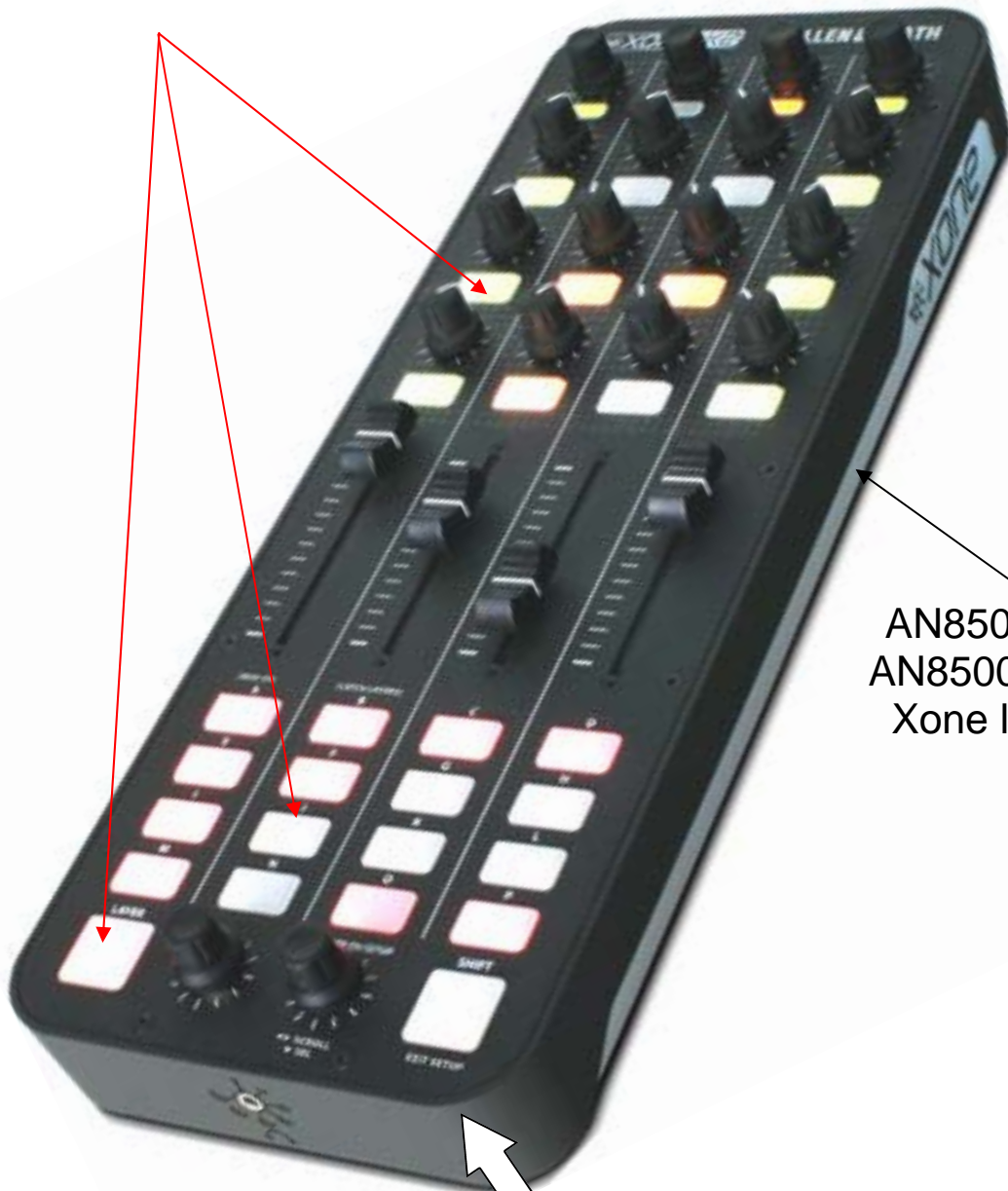
AN8500-L (left) AN8500-R (right) Xone logo trim